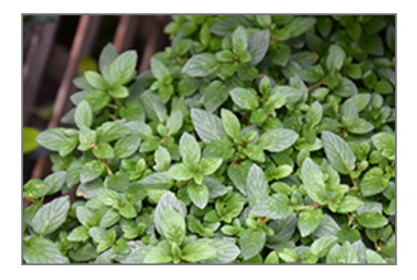
Peppermint foliage

Peppermint features bold spikes of lavender flowers with pink overtones rising above the foliage in mid summer. Its attractive fragrant pointy leaves remain green in color throughout the season.