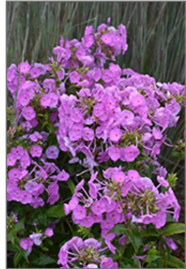
Fashionably Early Flamingo Garden Phlox flowers