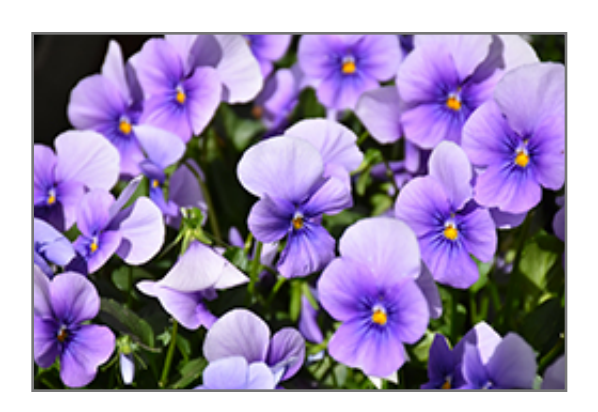
Sorbet Icy Blue Pansy flowers

Sorbet Icy Blue Pansy is recommended for the following landscape applications;