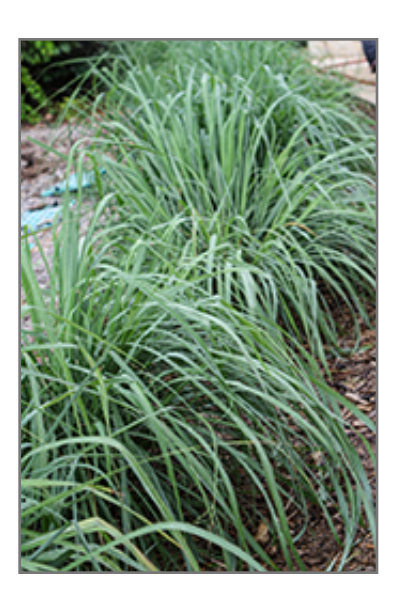
Lemon Grass

Aside from its primary use as an edible, Lemon Grass is sutiable for the following landscape applications;