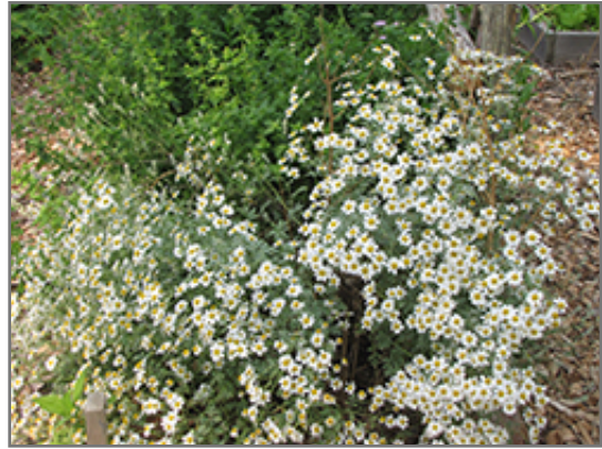
German Chamomile

* This is a 'special order' plant - contact store for details