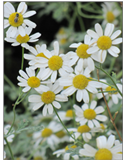
German Chamomile flowers