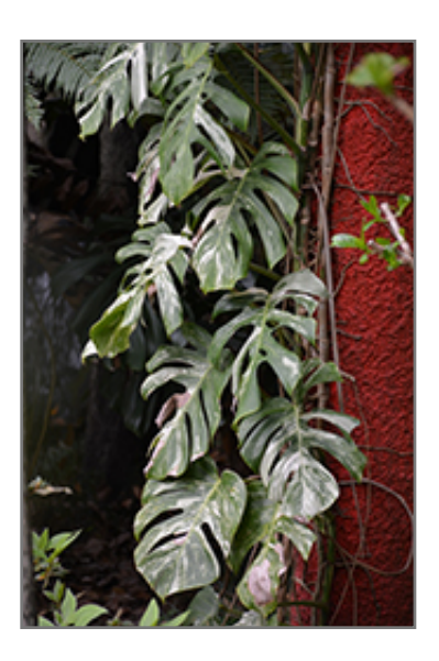
Thai Constellation Monstera

When grown indoors, Thai Constellation Monstera can be expected to grow to be about 16 feet tall at maturity, with a spread of 4 feet. It grows at a medium rate, and under ideal conditions can be expected to live for approximately 20 years. This houseplant performs well in both bright or indirect sunlight and strong artificial light, and can therefore be situated in almost any well-lit room or location. It does best in average to evenly moist soil, but will not tolerate standing water. The surface of the soil shouldn't be allowed to dry out completely, and so you should expect to water this plant once and possibly even twice each week. Be aware that your particular watering schedule may vary depending on its location in the room, the pot size, plant size and other conditions; if in doubt, ask one of our experts in the store for advice. It is not particular as to soil type or pH; an average potting soil should work just fine. Be warned that parts of this plant are known to be toxic to humans and animals, so special care should be exercised if growing it around children and pets.