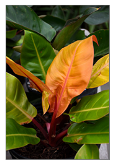
Prismacolor Prince of Orange Philodendron foliage