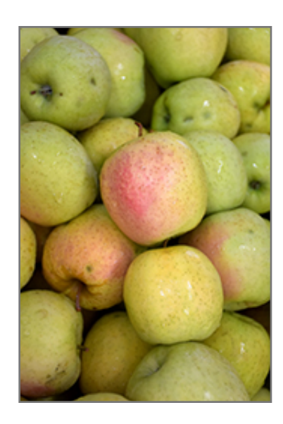
Dorsett Golden Apple fruit

Dorsett Golden Apple features showy clusters of lightly-scented white flowers with shell pink overtones along the branches from early to mid spring, which emerge from distinctive pink flower buds. It has forest green deciduous foliage. The pointy leaves turn yellow in fall. The fruits are showy light green apples with a rose blush and which fade to chartreuse over time, which are carried in abundance in mid summer. The fruit can be messy if allowed to drop on the lawn or walkways, and may require occasional clean-up.