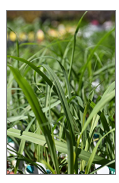
Lemon Grass foliage

Aside from its primary use as an edible, Lemon Grass is sutiable for the following landscape applications;