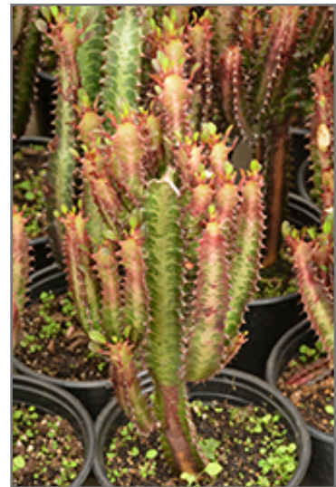
Rubra African Milk Tree in full