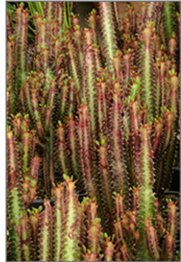
Rubra African Milk Tree stems

When grown indoors, Rubra African Milk Tree can be expected to grow to be about 9 feet tall at maturity, with a spread of 4 feet. It grows at a medium rate, and under ideal conditions can be expected to live for approximately 60 years. This houseplant will do well in a location that gets either direct or indirect sunlight, although it will usually require a more brightly-lit environment than what artificial indoor lighting alone can provide. It does best in average soil that is neither too wet nor too dry, and may die if left in standing water for any length of time. This plant should be watered when the surface of the soil gets dry, and will need watering approximately once each week. Be aware that your particular watering schedule may vary depending on its location in the room, the pot size, plant size and other conditions; if in doubt, ask one of our experts in the store for advice. Like most succulents and cacti, it prefers to grow in poor soils and should therefore never be fertilized. It is not particular as to soil pH, but grows best in sandy soil. Contact the store for specific recommendations on pre-mixed potting soil for this plant. Be warned that parts of this plant are known to be toxic to humans and animals, so special care should be exercised if growing it around children and pets.