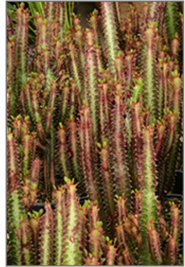
Rubra African Milk Tree stems

When grown indoors, Rubra African Milk Tree can be expected to grow to be about 9 feet tall at maturity, with a spread of 4 feet. It grows at a medium rate, and under ideal conditions can be expected to live for approximately 60 years. This houseplant will do well in a location that gets either direct or indirect sunlight, although it will usually require a more brightly-lit environment than what artificial indoor lighting alone can provide. It does best in average soil that is neither too wet nor too dry, and may die if left in standing water for any length of time. This plant should be watered when the surface of the soil gets dry, and will need watering approximately once each week. Be aware that your particular watering schedule may vary depending on its location in the room, the pot size, plant size and other conditions; if in doubt, ask one of our experts in the store for advice. Like most succulents and cacti, it prefers to grow in poor soils and should therefore never be fertilized. It is not particular as to soil pH, but grows best in sandy soil. Contact the store for specific recommendations on pre-mixed potting soil for this plant. Be warned that parts of this plant are known to be toxic to humans and animals, so special care should be exercised if growing it around children and pets.