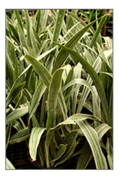
Sayuri Snake Plant foliage

When grown indoors, Sayuri Snake Plant can be expected to grow to be about 3 feet tall at maturity, with a spread of 18 inches. It grows at a slow rate, and under ideal conditions can be expected to live for approximately 10 years. This houseplant performs well in both bright or indirect sunlight and strong artificial light, and can therefore be situated in almost any well-lit room or location. It is very adaptable to both dry and moist soil, and should do just fine under average home conditions. The surface of the soil shouldn't be allowed to dry out completely, and so you should expect to water this plant once and possibly even twice each week. Be aware that your particular watering schedule may vary depending on its location in the room, the pot size, plant size and other conditions; if in doubt, ask one of our experts in the store for advice. It will benefit from a regular feeding with a general-purpose fertilizer with every second or third watering. It is not particular as to soil pH, but grows best in sandy soil. Contact the store for specific recommendations on pre-mixed potting soil for this plant.