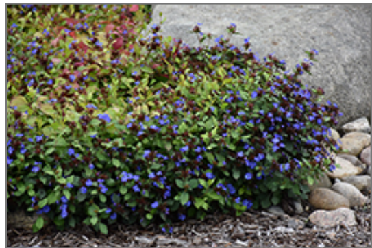
Plumbago in bloom