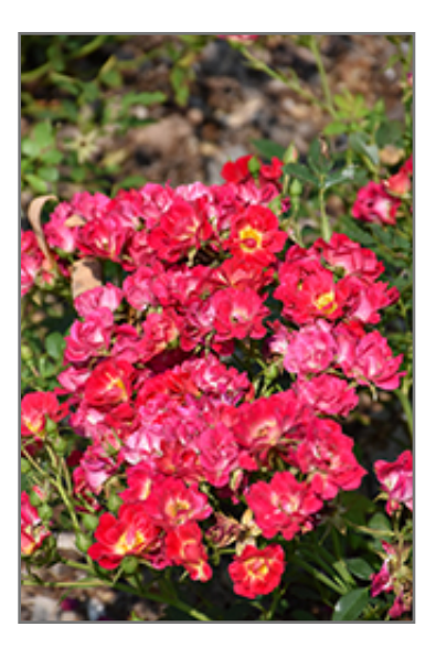
Pink Drift Rose flowers

Pink Drift Rose is recommended for the following landscape applications;