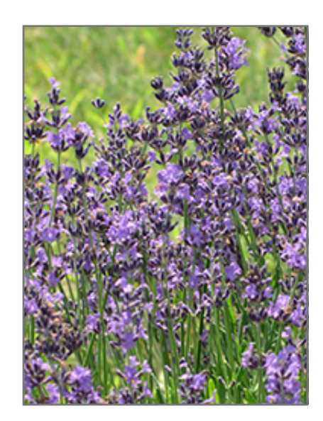
English Lavender flowers

This is a relatively low maintenance shrub, and can be pruned at anytime. It is a good choice for attracting butterflies to your yard, but is not particularly attractive to deer who tend to leave it alone in favor of tastier treats. It has no significant negative characteristics.