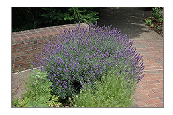
English Lavender in bloom

English Lavender is a dense multi-stemmed evergreen shrub with a mounded form. It lends an extremely fine and delicate texture to the landscape composition which should be used to full effect.