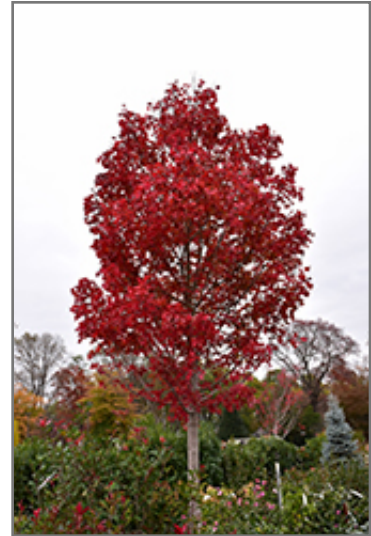
October Glory Red Maple in fall