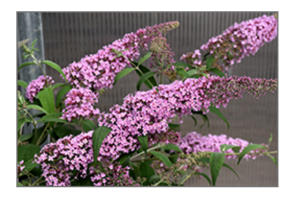
Pink Delight Butterfly Bush flowers

Pink Delight Butterfly Bush is recommended for the following landscape applications;