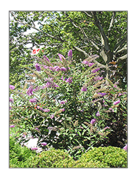
Pink Delight Butterfly Bush in bloom