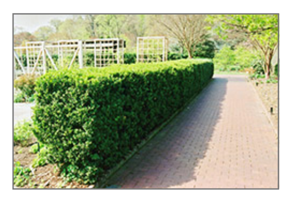
Common Boxwood