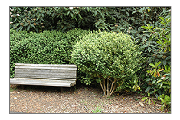
Common Boxwood