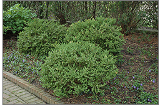
Wintergreen Boxwood