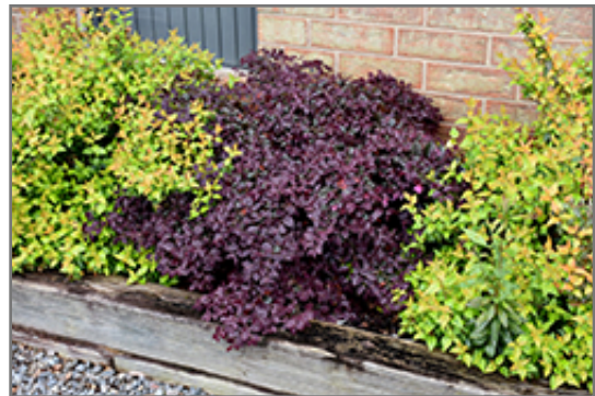
Purple Pixie Fringeflower