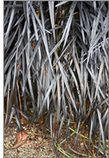
Black Mondo Grass foliage

Black Mondo Grass is a fine choice for the garden, but it is also a good selection for planting in outdoor pots and containers. It is often used as a 'filler' in the 'spiller-thriller-filler' container combination, providing a mass of flowers and foliage against which the thriller plants stand out. Note that when growing plants in outdoor containers and baskets, they may require more frequent waterings than they would in the yard or garden.