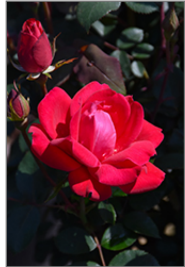
Double Knock Out Rose flowers

Double Knock Out Rose is recommended for the following landscape applications;