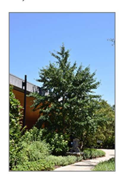
Autumn Gold Ginkgo