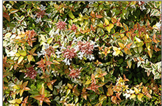
Kaleidoscope Abelia flowers

This shrub will require occasional maintenance and upkeep, and should only be pruned after flowering to avoid removing any of the current season's flowers. It is a good choice for attracting birds, bees and butterflies to your yard, but is not particularly attractive to deer who tend to leave it alone in favor of tastier treats. It has no significant negative characteristics.