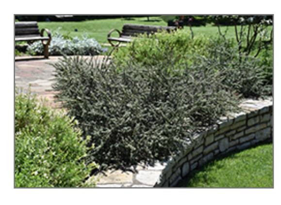
Gray Leaf Cotoneaster