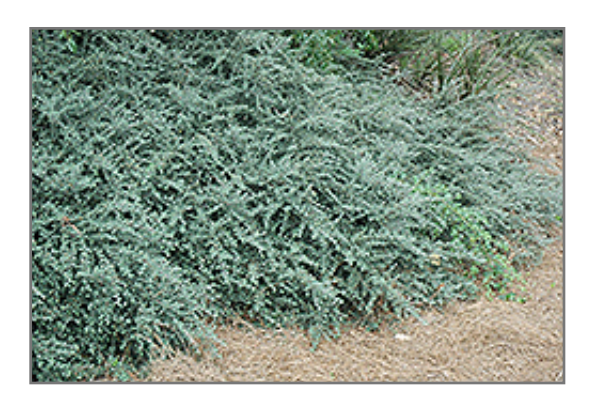
Gray Leaf Cotoneaster

Gray Leaf Cotoneaster will grow to be about 4 feet tall at maturity, with a spread of 6 feet. It tends to fill out right to the ground and therefore doesn't necessarily require facer plants in front. It grows at a fast rate, and under ideal conditions can be expected to live for approximately 30 years.