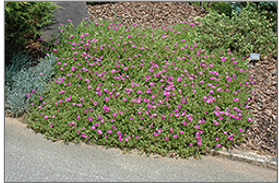
Purple Ice Plant in bloom

Purple Ice Plant will grow to be only 2 inches tall at maturity extending to 3 inches tall with the flowers, with a spread of 24 inches. Its foliage tends to remain low and dense right to the ground. It grows at a fast rate, and under ideal conditions can be expected to live for approximately 5 years. As an evergreen perennial, this plant will typically keep its form and foliage year-round.