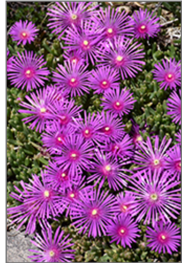
Purple Ice Plant flowers

Purple Ice Plant is recommended for the following landscape applications;