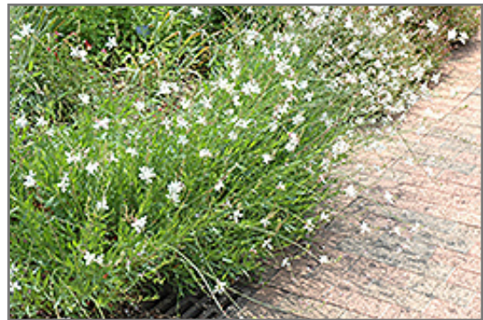
Whirling Butterflies Gaura in bloom