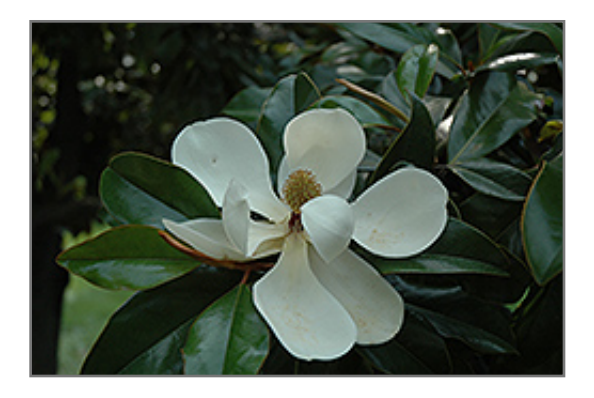
Southern Magnolia flowers

This is a relatively low maintenance tree, and should only be pruned after flowering to avoid removing any of the current season's flowers. It is a good choice for attracting birds and squirrels to your yard, but is not particularly attractive to deer who tend to leave it alone in favor of tastier treats. It has no significant negative characteristics.