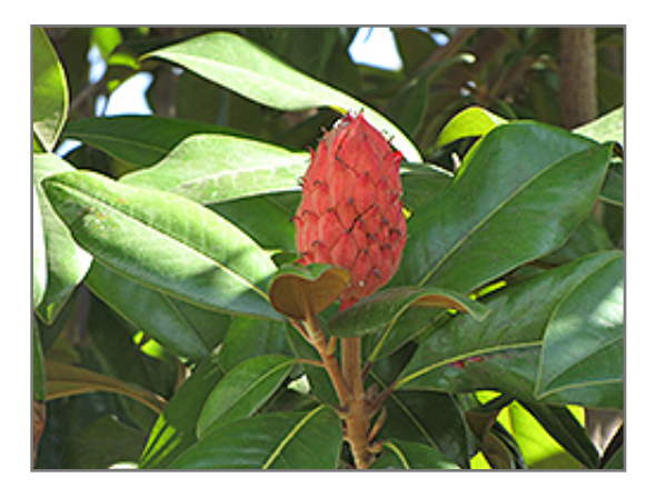
Southern Magnolia fruit

* This is a 'special order' plant - contact store for details