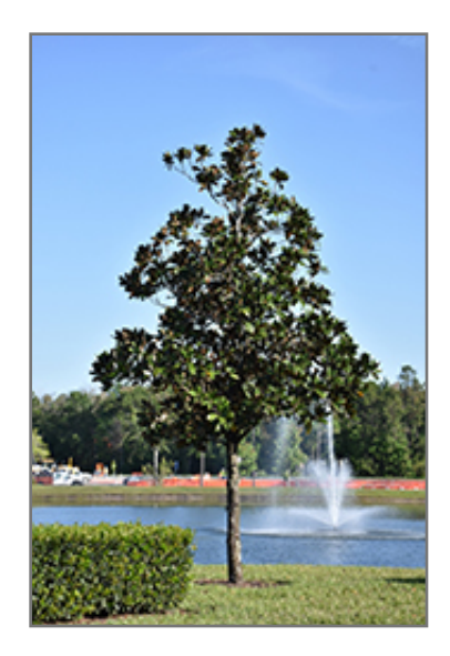
Southern Magnolia