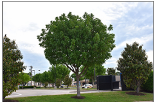
Chinese Pistache