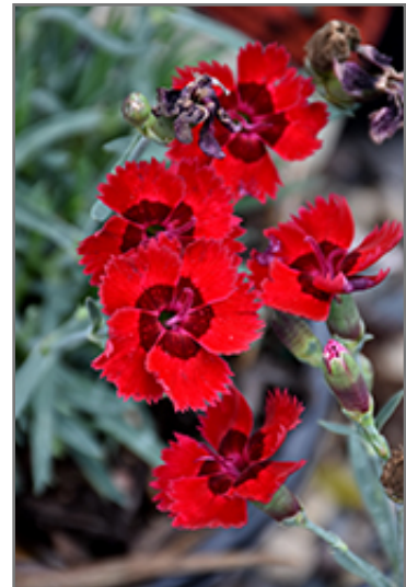
Fire Star Pinks flowers

Fire Star Pinks is recommended for the following landscape applications;