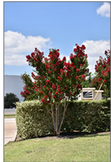
Dynamite Crapemyrtle in bloom