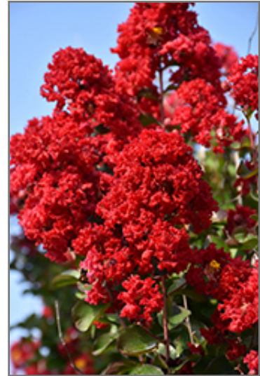
Dynamite Crapemyrtle flowers