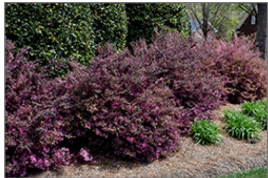
Purple Diamond Fringeflower in bloom