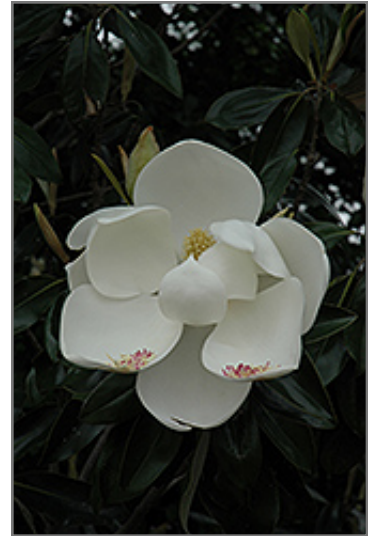
Teddy Bear Magnolia flowers