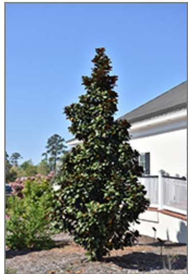
Teddy Bear Magnolia