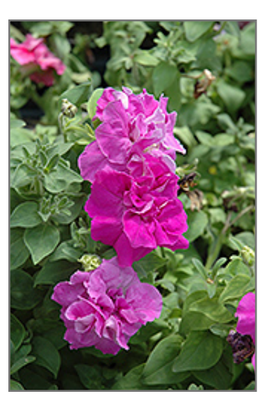
Double Madness Lavender Petunia flowers