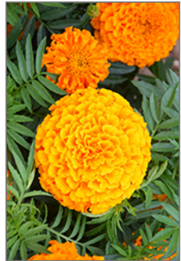
Taishan Orange Marigold flowers