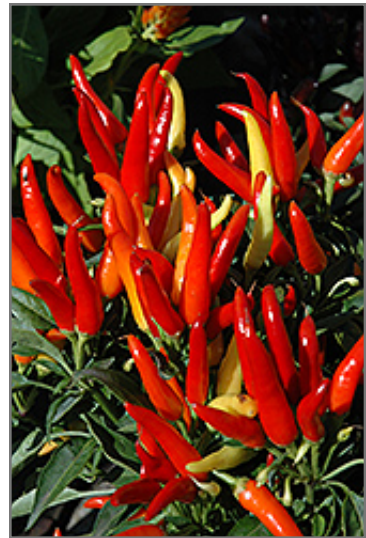
Chilly Chili Ornamental Pepper fruit

Chilly Chili Ornamental Pepper is an herbaceous annual with an upright spreading habit of growth. Its medium texture blends into the garden, but can always be balanced by a couple of finer or coarser plants for an effective composition.