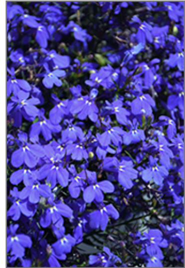
Techno Blue Lobelia flowers

Techno Blue Lobelia is recommended for the following landscape applications;