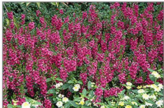
Archangel Dark Rose Angelonia in bloom