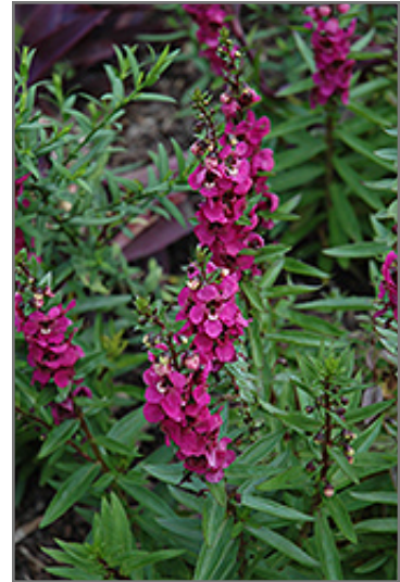
Serenita Raspberry Angelonia flowers

Serenita Raspberry Angelonia is recommended for the following landscape applications;