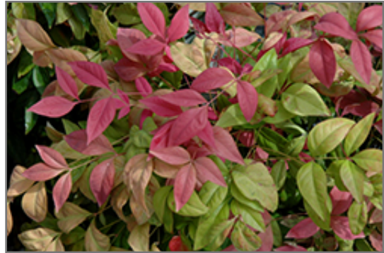
Blush Pink Nandina foliage

Blush Pink Nandina is recommended for the following landscape applications;