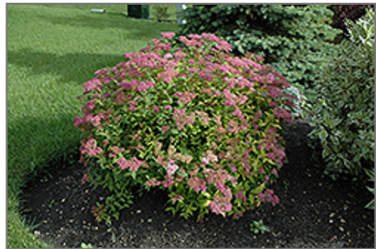
Goldflame Spirea in bloom