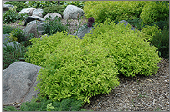
Goldmound Spirea