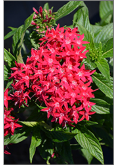
Graffiti OG Lipstick Star Flower flowers

Graffiti OG Lipstick Star Flower is recommended for the following landscape applications;