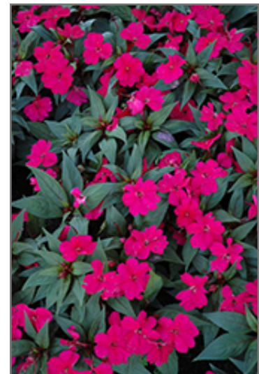
SunPatiens Compact Royal Magenta New Guinea Impatiens flowers