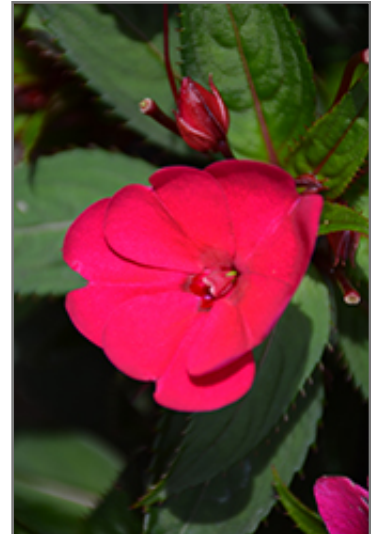
SunPatiens Compact Royal Magenta New Guinea Impatiens flowers

This plant will require occasional maintenance and upkeep, and should not require much pruning, except when necessary, such as to remove dieback. It is a good choice for attracting bees and butterflies to your yard. It has no significant negative characteristics.