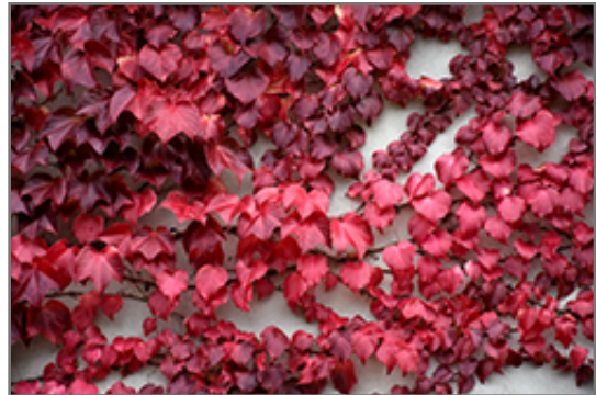
Veitch Boston Ivy in fall