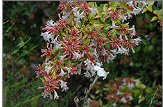
Francis Mason Abelia flowers

Francis Mason Abelia is recommended for the following landscape applications;