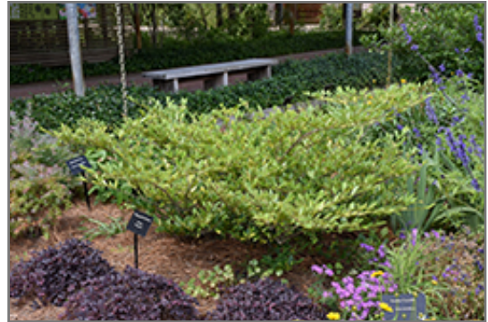
Vintage Jade Evergreen Distylium

Vintage Jade Evergreen Distylium is recommended for the following landscape applications;