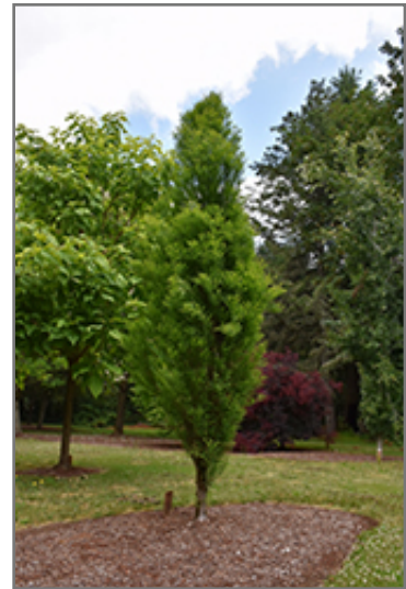
Lindsey's Skyward Bald Cypress