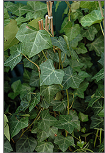
Thorndale Ivy foliage