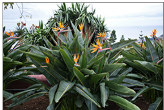
Orange Bird Of Paradise in bloom