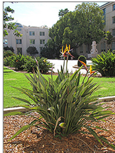
Orange Bird Of Paradise in bloom

Orange Bird Of Paradise is a fine choice for the garden, but it is also a good selection for planting in outdoor pots and containers. With its upright habit of growth, it is best suited for use as a 'thriller' in the 'spiller-thriller-filler' container combination; plant it near the center of the pot, surrounded by smaller plants and those that spill over the edges. It is even sizeable enough that it can be grown alone in a suitable container. Note that when growing plants in outdoor containers and baskets, they may require more frequent waterings than they would in the yard or garden.