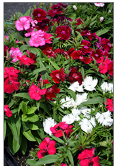
Floral Lace Mix Pinks flowers